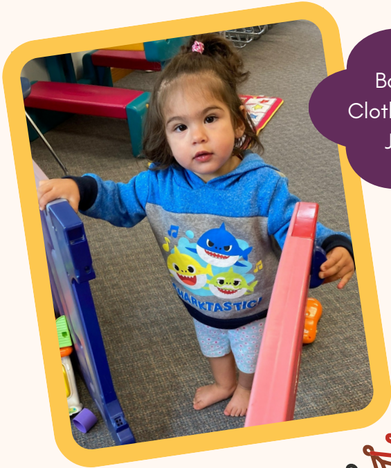
Baby & Toddler Clothing & Toy Swap June 8, 2022